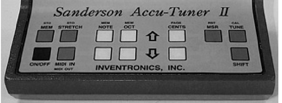
Fig. 2. Keyboard of the Accu-Tuner II ™.

Each mode is entered by pressing the appropriate button or sequence of buttons on the keyboard, which is shown in figure 2.