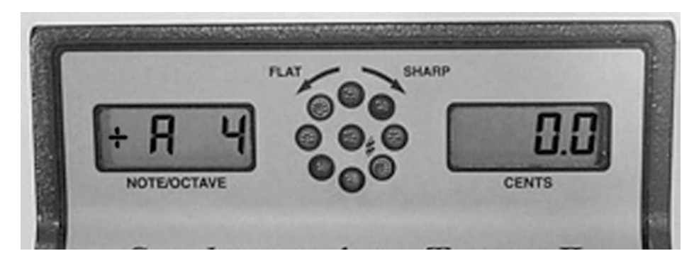
Fig. 5. Display with non-standard pitch warning.

It is also possible to tune off-pitch by accident. To help prevent this from happening, a plus sign appears in the NOTE/OCTAVE display window as shown in Fig. 5. Whenever the instrument is offset to the sharp side, a plus sign will appear. When the SAT is offset to the flat side, a minus sign will appear.