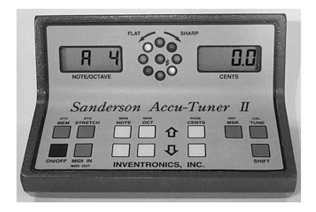
Fig. 1. Sanderson Accu-Tuner II ™.

The built-in FAC Stretch Calculator feature automatically programs the Accu-Tuner to give a complete 88-note customstretch tuning. All operations of the SAT are controlled from the sealed membrane keyboard telling the computer which functions to perform. Push the CENTS up button to raise the pitch; press the CENTS down button to lower the pitch. Similarly, to go up a semitone, press NOTE up, or to go down an octave, press OCTAVE down. The present pitch settings are always indicated on the pair of LCD (liquid-crystal display) windows as NOTE/OCTAVE and CENTS. Fig. 1 shows the SAT set for the note A in the fourth octave, 0.0 cents.